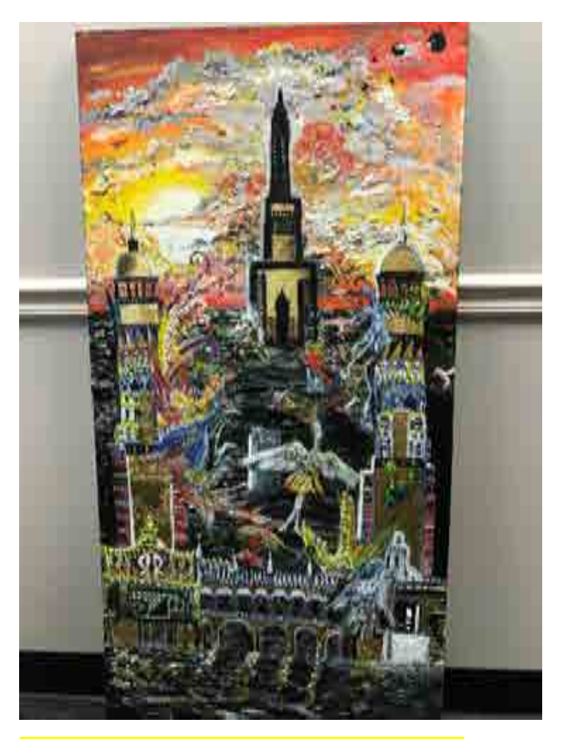
Second Place Winner: Juan-Camilo Rivera

Title: "Birds of Paradise in a post-glacial cityscape"